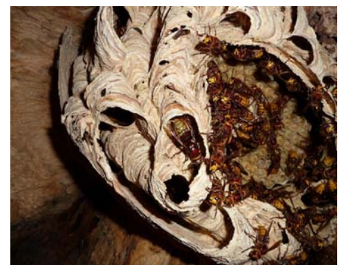
A hornets' nest. The beige coloration and blistery bulges are diagnostic

Hymettus Ltd is the premier source of advice on the conservation of bees, wasps and ants within Great Britain and Ireland.