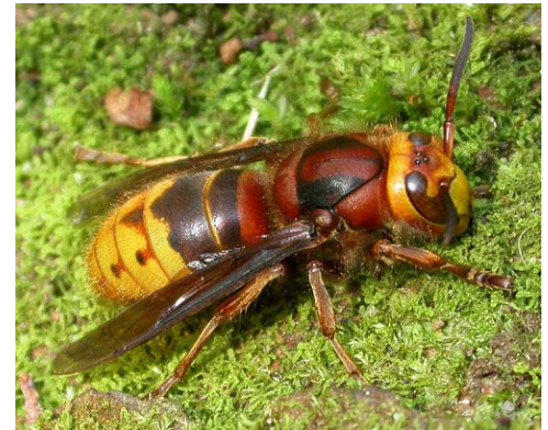
A queen hornet after emerging from hibernation

They help maintain balance in nature by preying upon (and so controlling) numbers of other invertebrate species, some of which are regarded as agricultural pests.