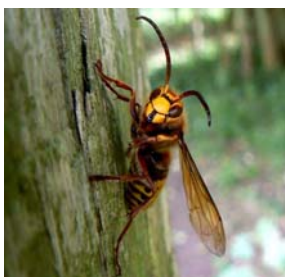
A male hornet showing typically long antennae