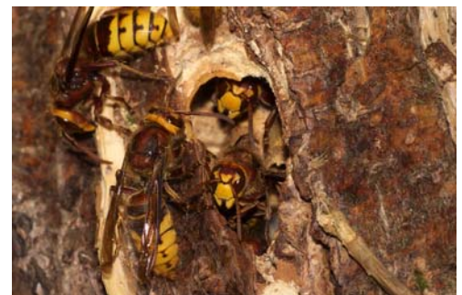
Worker hornets emerging from a nest in a hollow tree