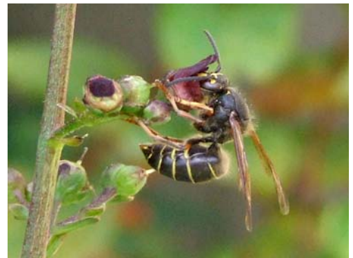
A dark worker visiting Figwort, a wasp pollinated plant