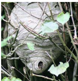
A nest suspended in a Beech hedge