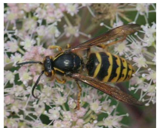
A male Median Wasp at Hogweed flowers

Hymettus Ltd is the premier source of advice on the conservation of bees, wasps and ants within Great Britain and Ireland.