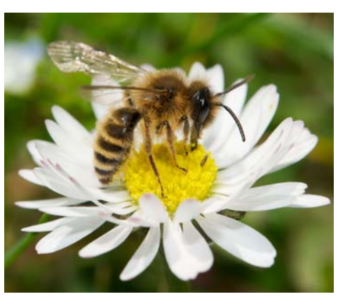
Male A. flavipes nectaring at Ox-eye Daisy