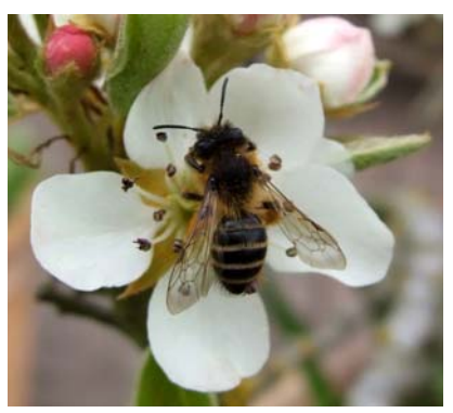
A female of Andrena flavipes at Pear