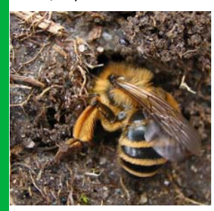
Female A. flavipes at nest entrance

Hymettus Ltd is the premier source of advice on the conservation of bees, wasps and ants within Great Britain and Ireland.