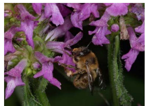
A female Anthophora with the beginnings of a pollen load on the hind legs

Hymettus Ltd is the premier source of advice on the conservation of bees, wasps and ants within Great Britain and Ireland.