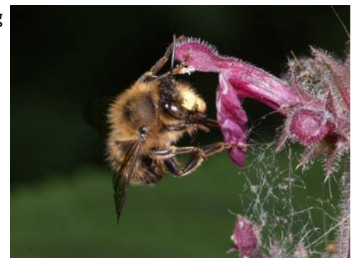
A male Anthophora furcata showing the yellow facial markings