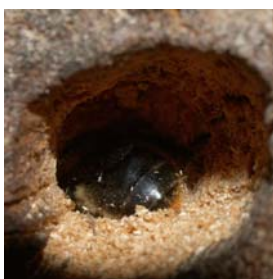
A female A. furcata excavating a nest burrow in dead wood