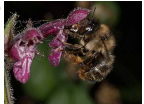
A female Anthophora furcata at Hedge Woundwort flowers

It is a widely distributed species in the UK, occurring as far north as south west Scotland. It is a Eurasian species, and a closely related species occurs in North America.