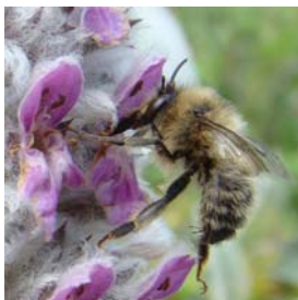
A male A. furcata at flowers of Lambs Ear

The females collect pollen from a number of plant species, although they are specialists on the Mint family which have tubular or complex flowers with restricted access to pollen and nectar. It is one of a small group of bees with morphological adaptations to collect pollen from such flowers, this consisting on specialised facial hairs with which it brushes the pollen from flower anthers while buzzing her wings, before moving the pollen it to her pollen baskets. In Britain it is commonly seen on Hedge Woundwort ( Stachys sylvatica ), Lambs Ears ( Stachys byzantina ), and nectaring on Foxgloves.