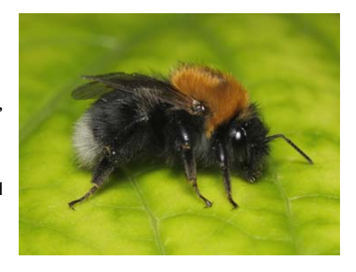
A queen of Bombus hypnorum at rest on a leaf