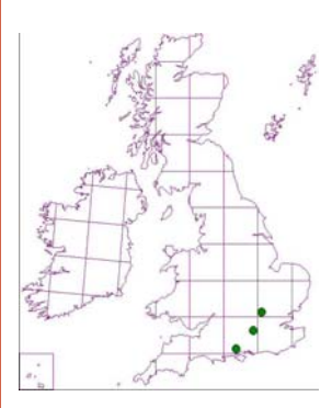
UK distribution of Bombus hypnorum 2004