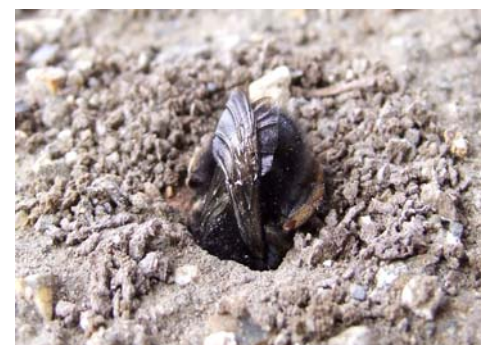
Female excavating a nest burrow in the ground