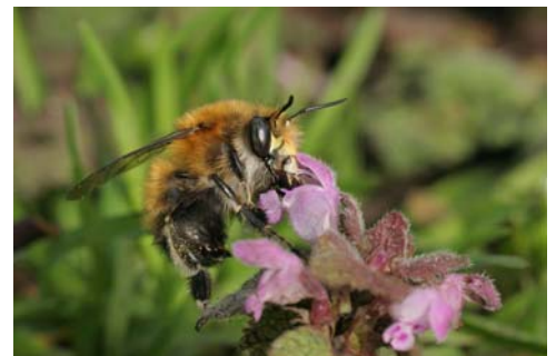
A male nectaring at flowers of Red Deadnettle