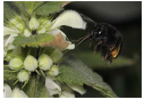
A female of Anthophora plumipes foraging at White Deadnettle

No special conservation measures are required.